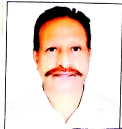
(Photograph of Donor)