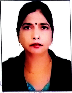
(Photograph of Recipient)